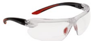
VERSIONS WITH READING AREA : +1.5 : IRIDPSI1,5 +2 : IRIDPSI2 +2.5 : IRIDPSI2,5 +3 : IRIDPSI3