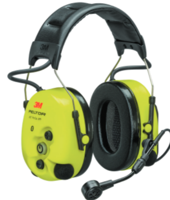
MT15H7AWS6 / MT15H7AWS6-111