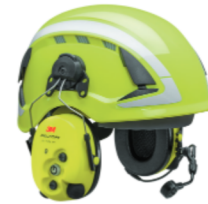
MT15H7P3EWS6 / MT15H7P3EWS6-111