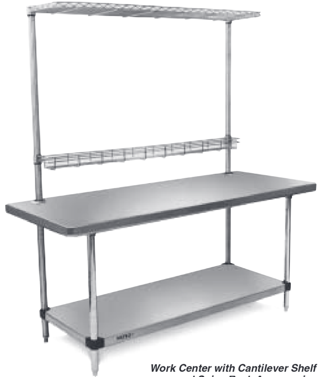
Work Center with Cantilever Shelf and Spice Rack Accessories